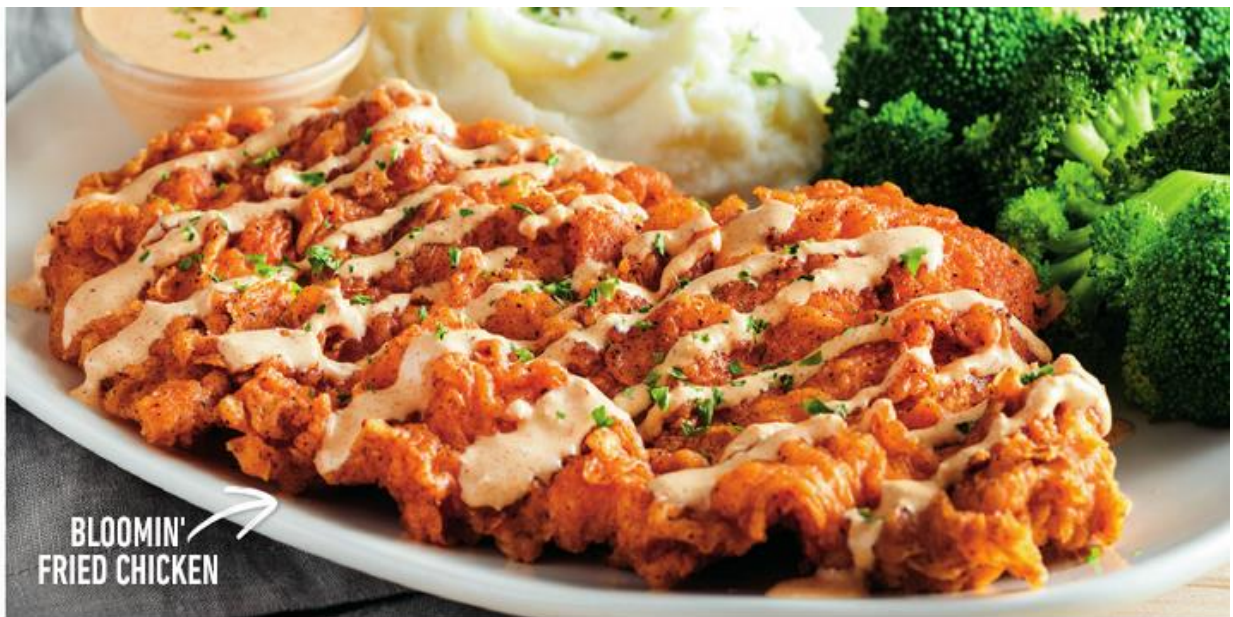
BLOOMIN' FRIED CHICKEN